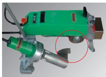
Welding seam width 40 mm