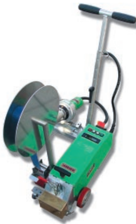
Tape welding 40mm or 50mm