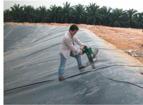
Civil Engineering & Construction Work